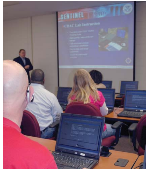
The expanded use of technologies in this CJI classroom greatly enhances the learning experience for both law enforcement students and instructors.